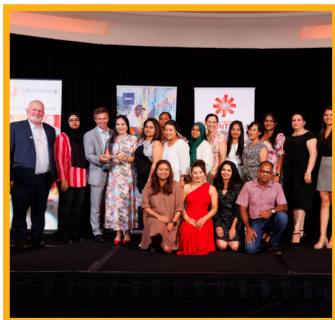
Connected Women NT

The Connected Women Program shines as a guiding light of transformation in the Northern Territory, epitomising the profound influence of volunteerism on community advancement. Rooted in the enduring dedication of Red Cross to humanitarian aid, this initiative leverages the potency of volunteers to propel positive change. At the heart of the success of the Connected Women Program is its committed volunteers, numbering over 200 individuals from diverse backgrounds. In 2022/23 the program engaged 547 volunteers. At the heart of Connected Women's impact and success is its Innovative Volunteer-Driven Model.