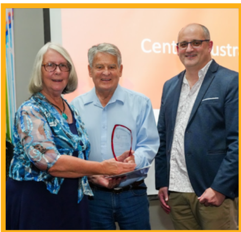
Central Australian Aviation Museum

The Central Australian Aviation Museum (CAAM), launched in 1979, is the 'keeper of the flame' of Central Australia's aviation history.